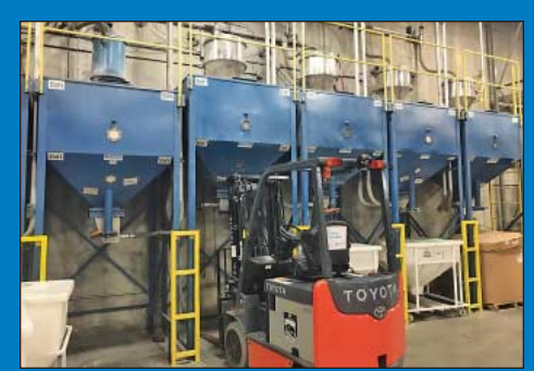
(9) 60" x 60" x 32" Novatec Cone Bottom Surge Bins