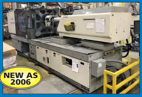
(4) 400 Ton x 55 Oz. Toyo Model 400H2 PIMM's