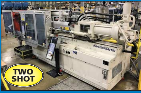
331 Ton x 33.6 Oz. Krauss Maffei Model 300-1900C2 PIMM w/ SP390 Bolt-On Injection Unit

4,000 Lb. Toyota Model 6HBW20 Electric Pallet Truck ; s/n 15473