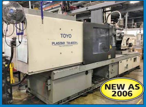
(4) 400 Ton x 55 Oz. Toyo Model 400H2 PIMM's