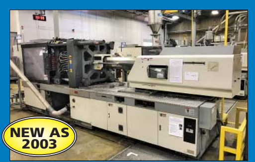
(7) 300 Ton x 31 Oz. Toyo Model 300H PIMM's