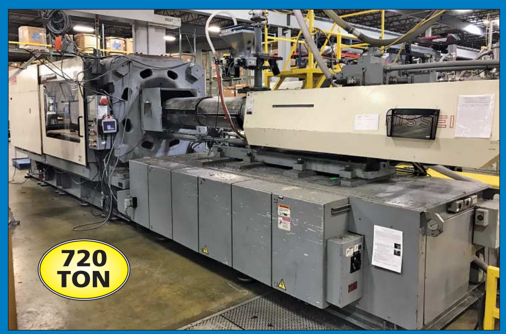
720 Ton x 107 Oz. Nissei Model FV9100-310L PIMM

PIMM; s/n 70087 (1999), No. 218, 23.5" Platen Table, 8.66" - 26.37" Daylight