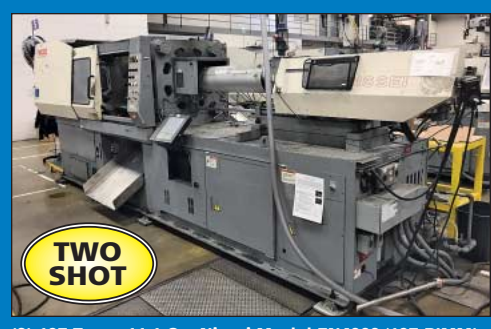
(2) 197 Ton x 11.1 Oz. Nissei Model FN4000/197 PIMM's