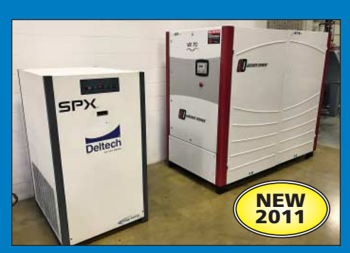
100-HP Gardner Denver Model VS45-70A Rotary Screw Air Compressor