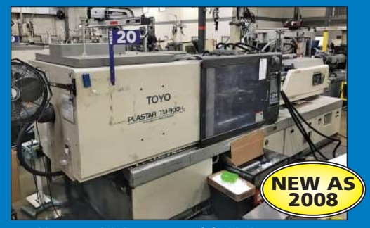
(3) 300 Ton x 32.8 Oz. Toyo Model 300H2 PIMM's