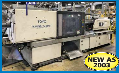
(7) 300 Ton x 31 Oz. Toyo Model 300H PIMM's