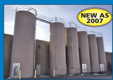
(6) 12' x 36' Imperial Industries / Novatec Model 4535 Welded Steel Silos