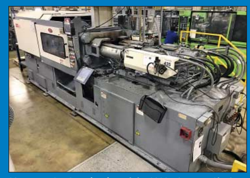
224 Ton x 8.5 Oz. Nissei Model DC200-12A Two-Shot PIMM