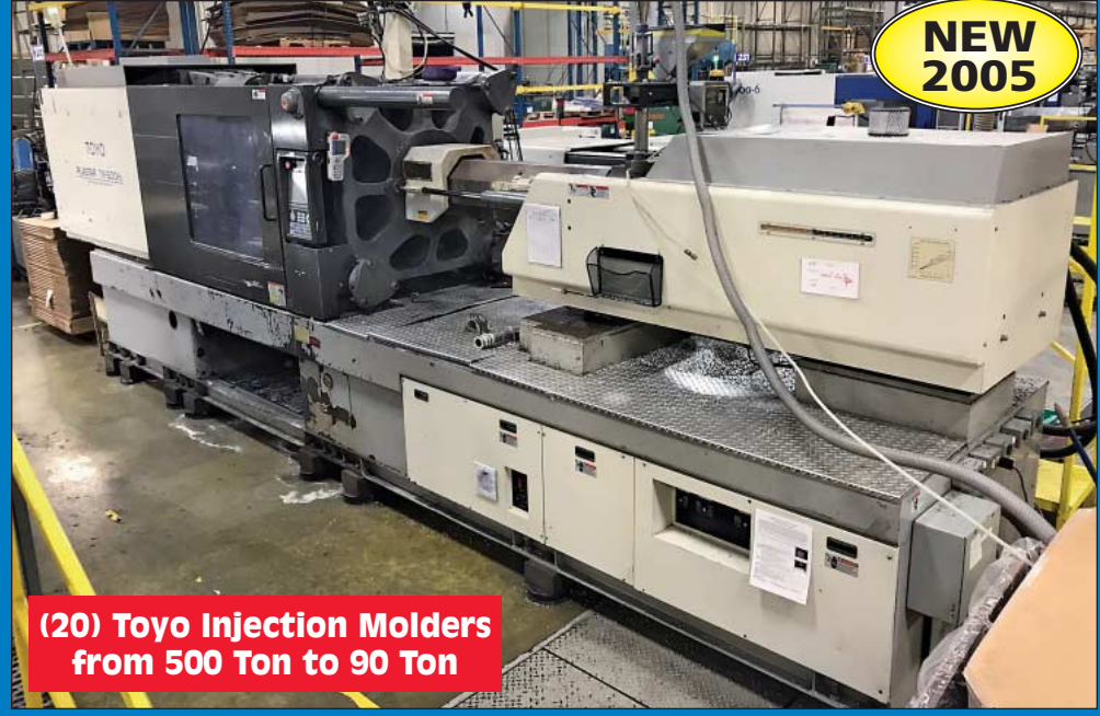
500 Ton x 80 Oz. Toyo Model 500H2 PIMM