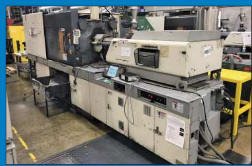
(3) 200 Ton x 13.1 Oz. Toyo Model TM-200H PIMM's