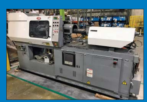
60 Ton x 3.6 Oz. Nissei Model PS60E9A PIMM