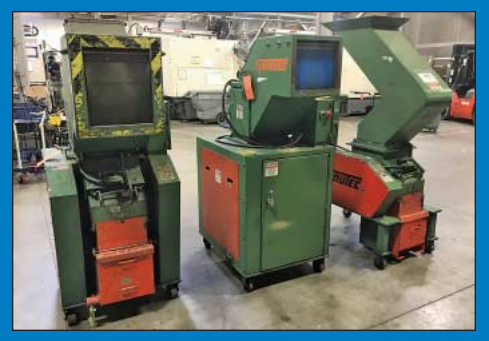
(20) Granutec Plastic Granulators from 5-HP to 15-